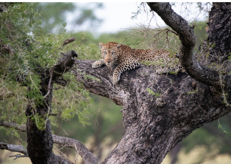
Leopard in a tree

Situated 40km north of Entebbe and its international airport, Kampala is a modern capital with a population of at least two million set at the hub of the national road network.