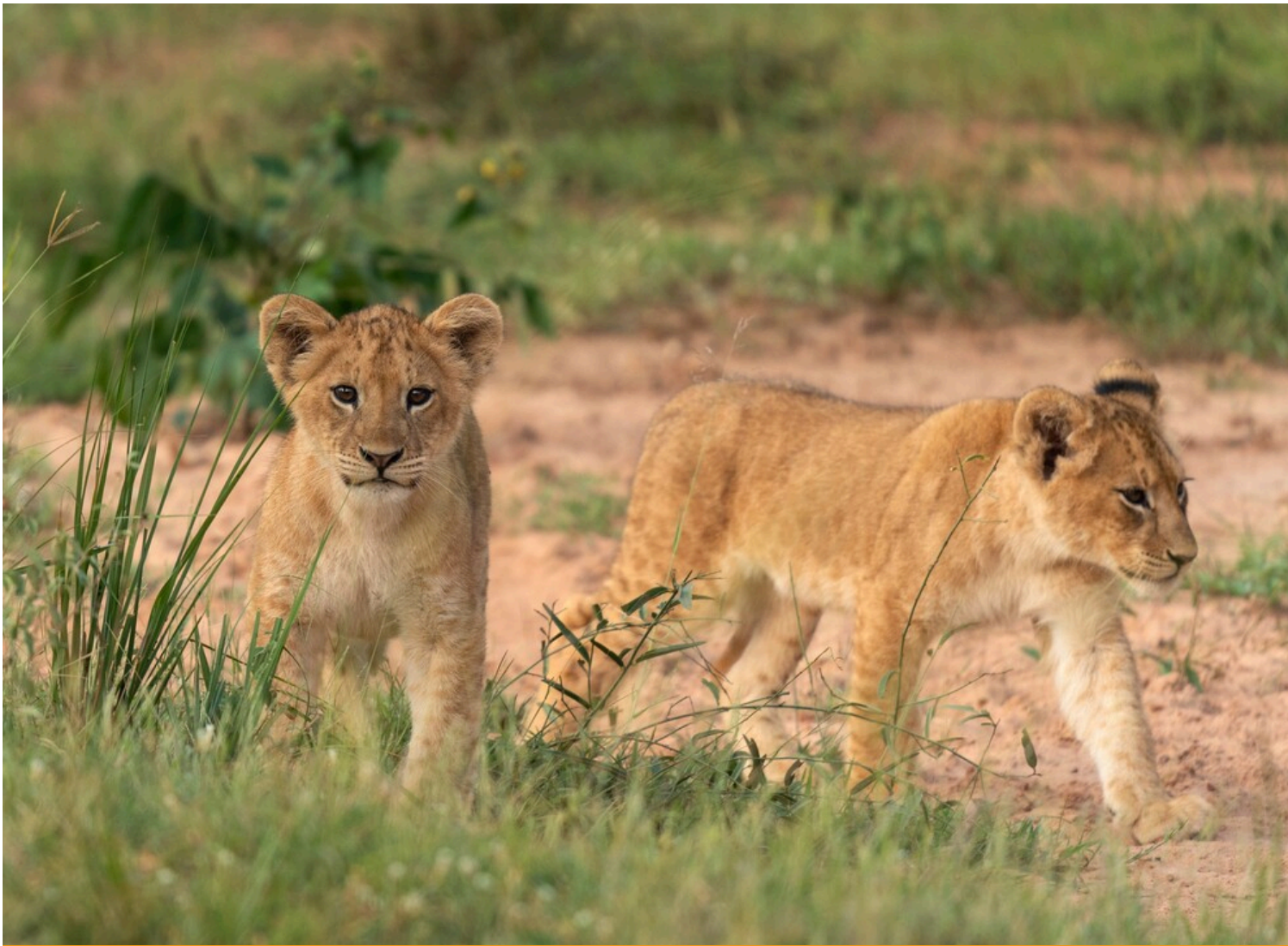
Murchison Falls National Park