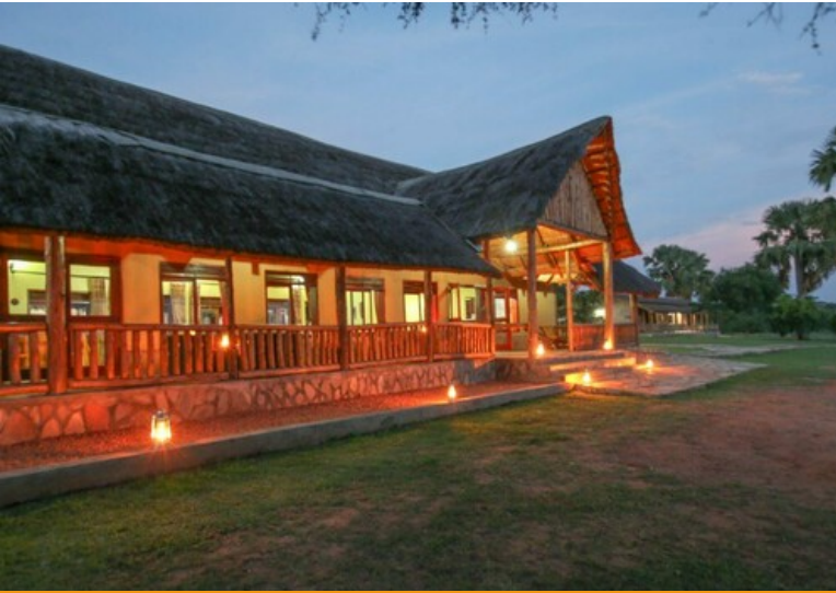
Pakuba Safari Lodge