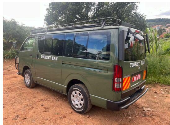
LUXURY SAFARI VAN