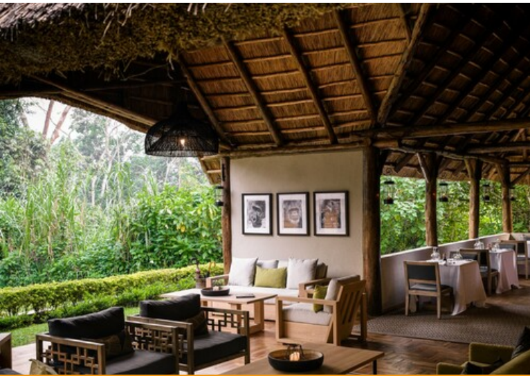
Sanctuary Gorilla Forest Camp