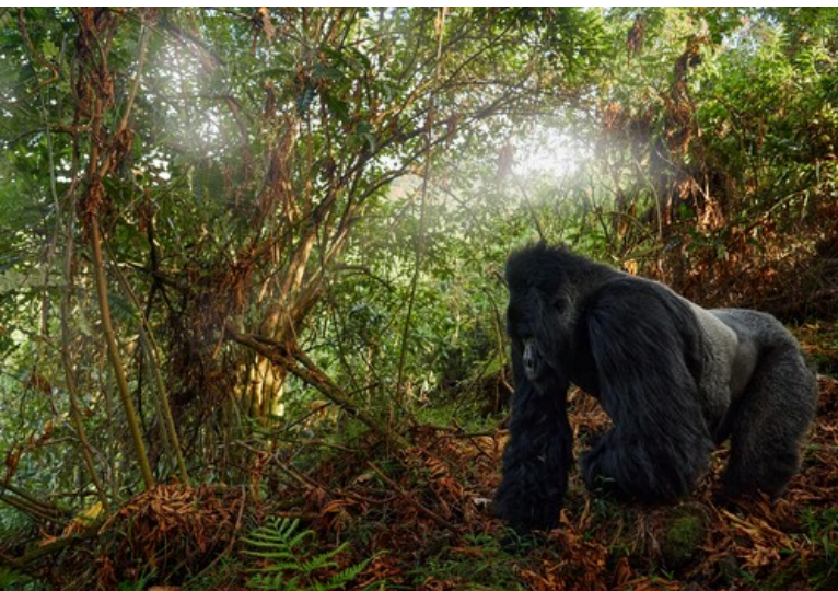
Mountain Gorilla Trekking