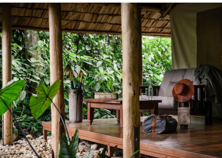
Sanctuary Gorilla Forest Camp