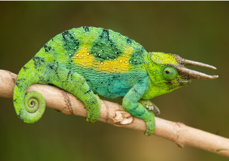
Rwenzori three-horned chameleon