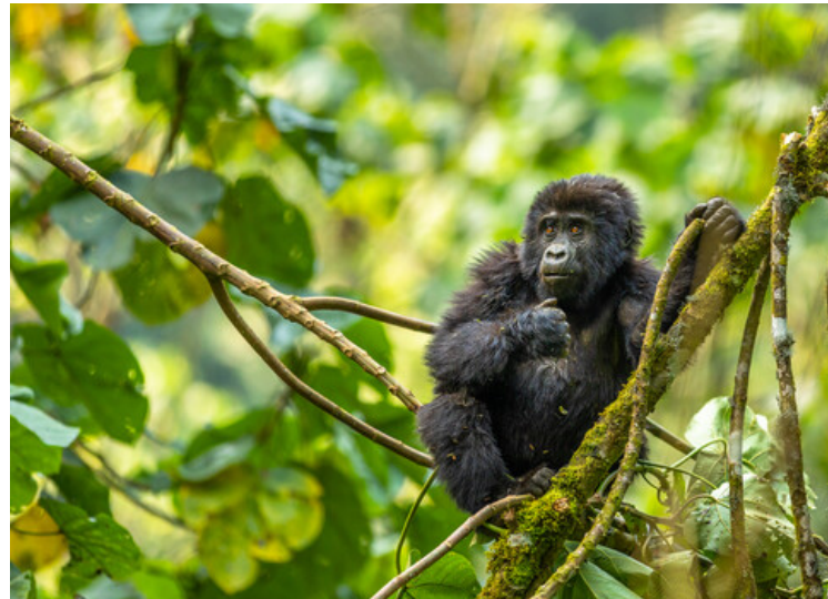
Mountain Gorilla Trekking