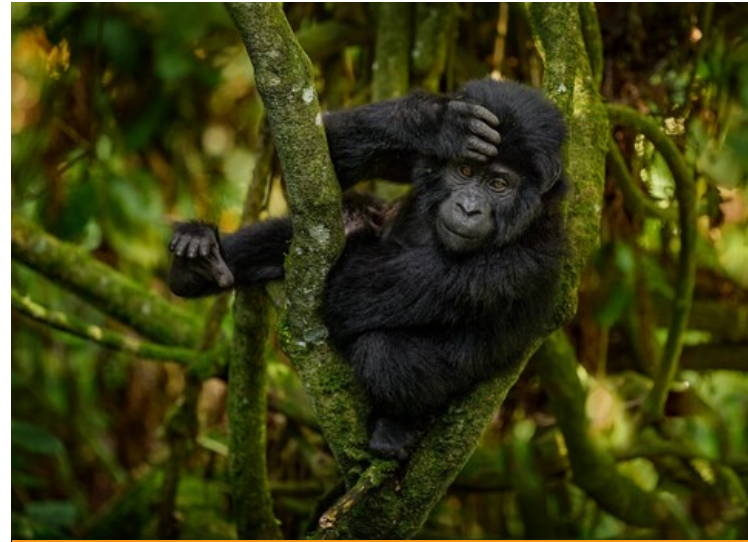
Bwindi Impenetrable National Park