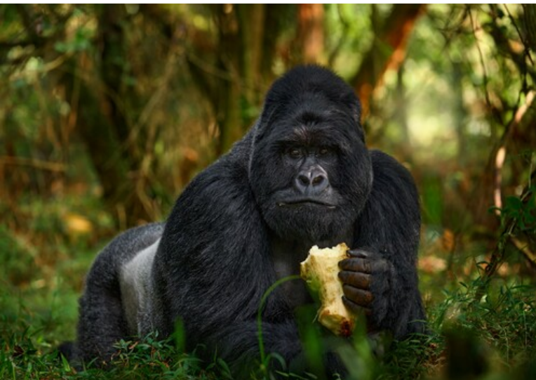
Bwindi Impenetrable National Park

Bwindi Impenetrable National Park protects one of Africa's most ancient highland forests. It has been inscribed as a UNESCO World Heritage Site on account of its rich biodiversity, which includes a great many plants and animals whose range is restricted to the Albertine Rift Valley. The best known of these is of course the mountain gorilla, but other local specialties include the handsome L'Hoest's monkey, spectacular Rwenzori three-horned chameleon and eagerly sought African green broadbill.