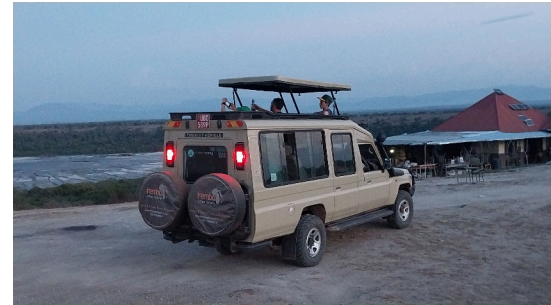
Safari Land Cruiser