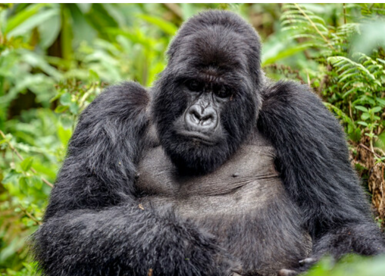
Volcanoes National Park