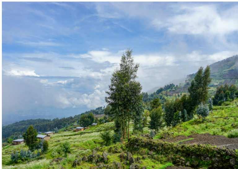
Volcanoes National Park