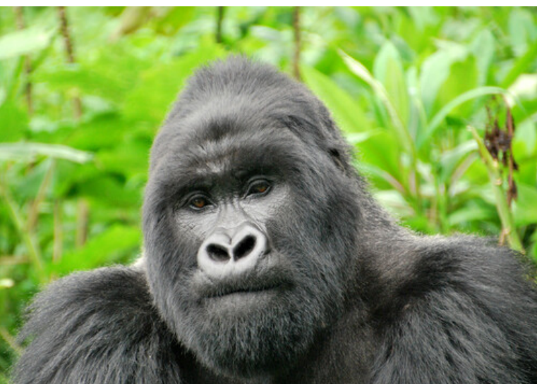
Volcanoes National Park