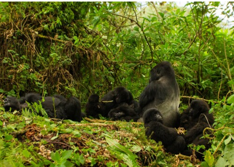
Volcanoes National Park