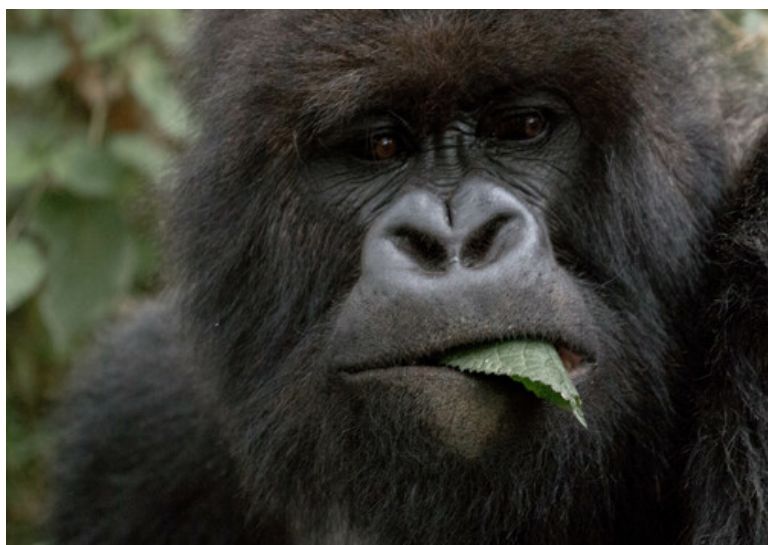
Volcanoes National Park