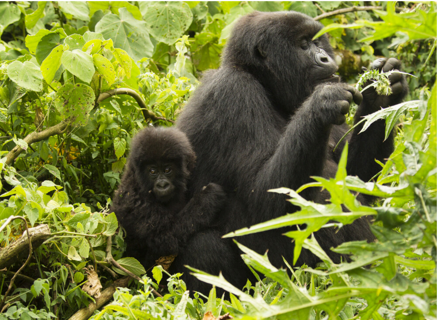
Volcanoes National Park