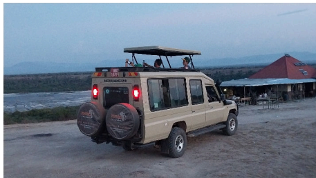
Safari Land Cruiser