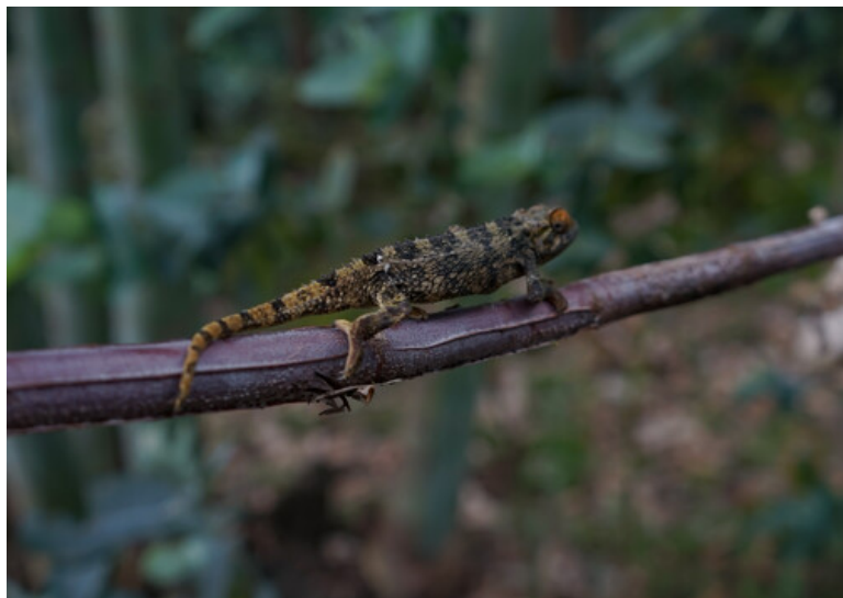
Volcanoes National Park